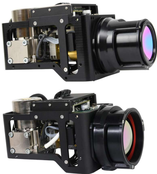
25 & 50 mm lens models